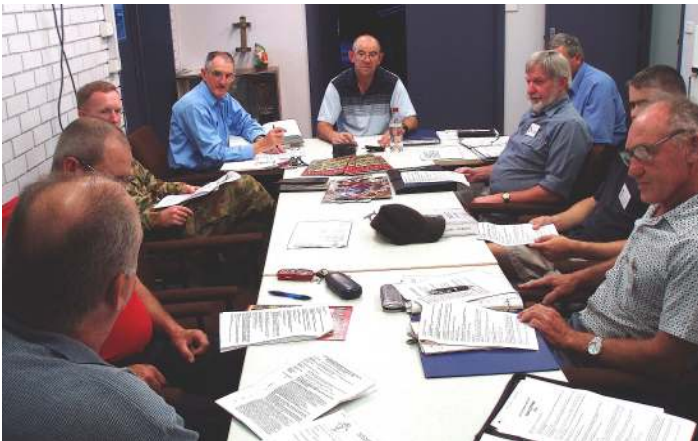
Your Committee in action

I received lots of positive feedback on the last Newsletter particularly from those who received it by email. They were particularly impressed by the quality and colour definition of the photos etc.