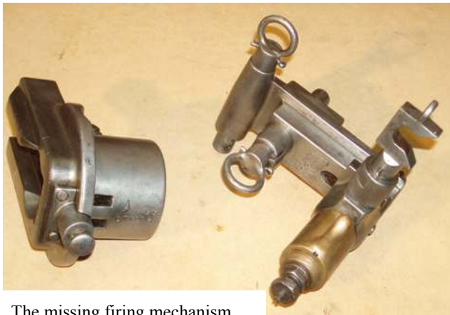
The missing firing mechanism.