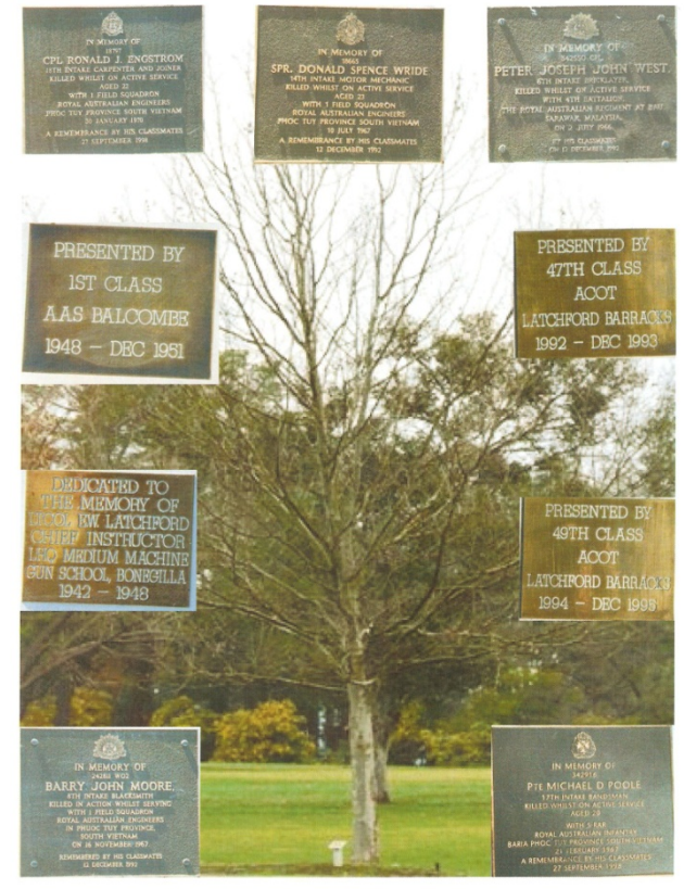
Full details and article in next newsletter

Did you know you have an Avenue of Honour?