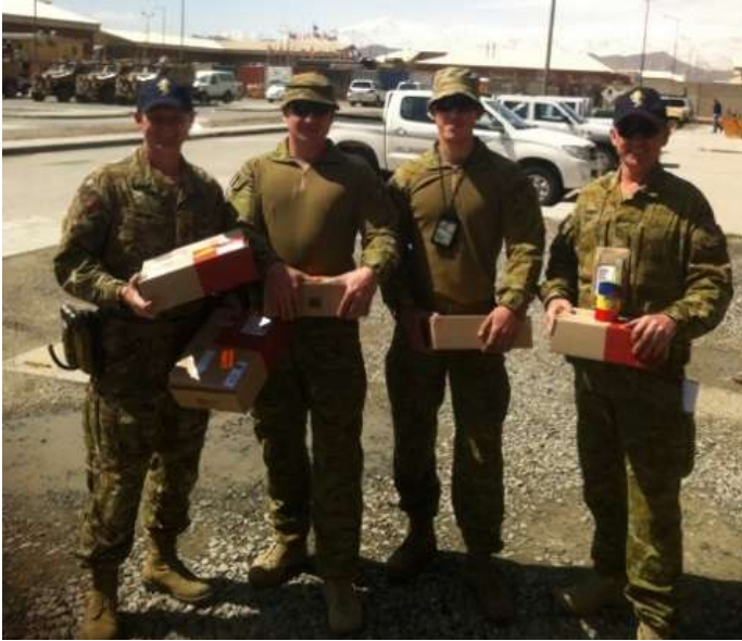
Some thankful recipients of OUR Spanner Packs