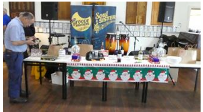
Checking out the numerous Raffle Prizes

This is always a great activity to catch up with old RAEME friends and fellow soldiers