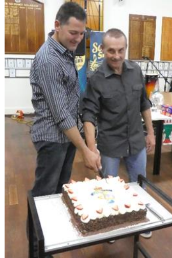
Cutting of the Corps Birthday Cake by two current serving members from 107 Fd Wksp Coy

As always, a special cake was prepared for the function and it was enjoyed by all.