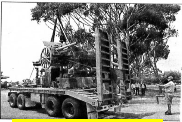
Unloading at Moonta Museum

The Viet Vets turned on a BBQ lunch for the committee and those of us from Adelaide before we returned. Most are planning to attend the opening ceremony in February and we now wonder what to do with our Mondays.