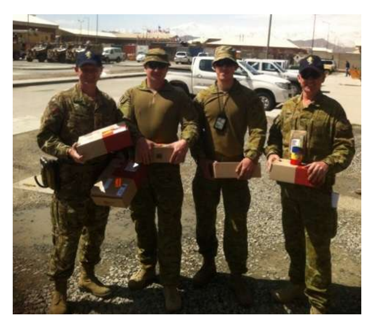
Some thankful recipients of <u>OUR</u> Spanner Packs