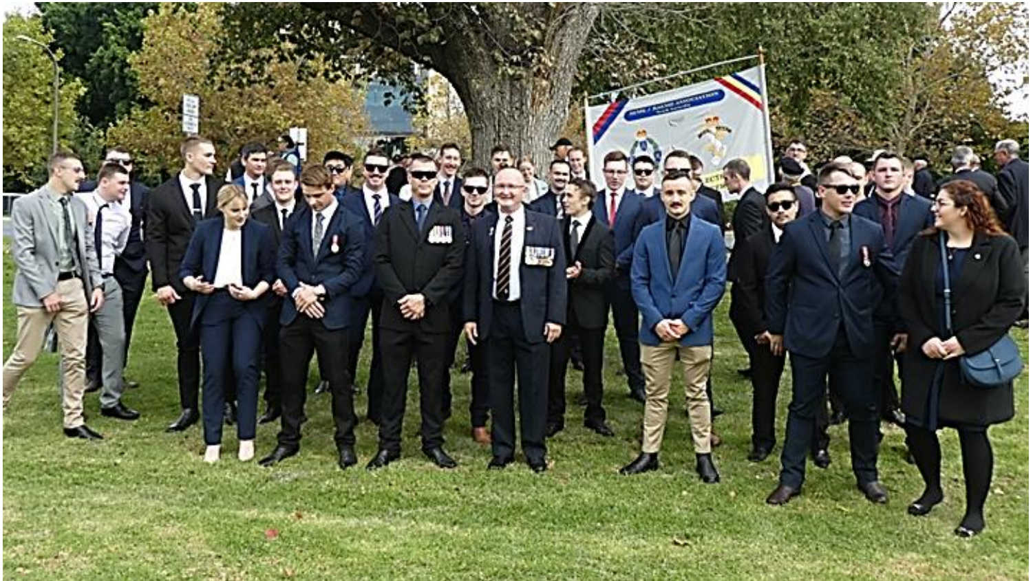
The ASEME Trainees after the March