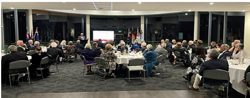
Last year's event

Bookings through Eventbrite: https://www.eventbrite.com.au/e/sa-logistics-and-health-services-associations-dinner-2022-tickets-399909739797 or 2022 Log and Health Services Dinner