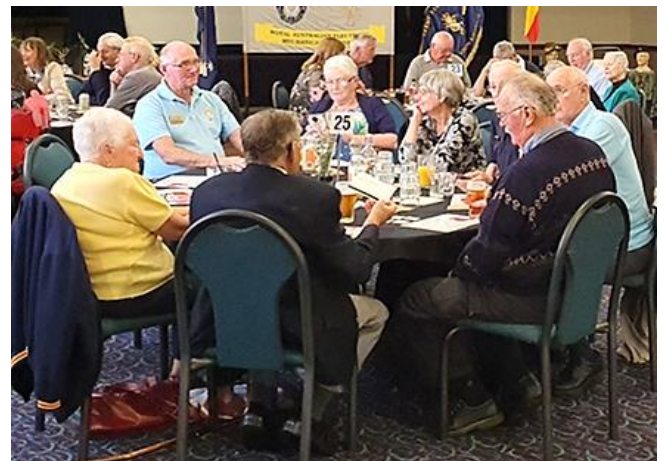
The REME Assn table