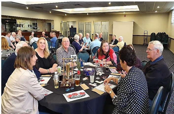
The Committee table

The 2022 RAEME Mixed ANZAC Function was held on Saturday 23 rd April at the West Adelaide Football Club Clubrooms at Richmond. This year it was a lunchtime event which seemed to please those attending.