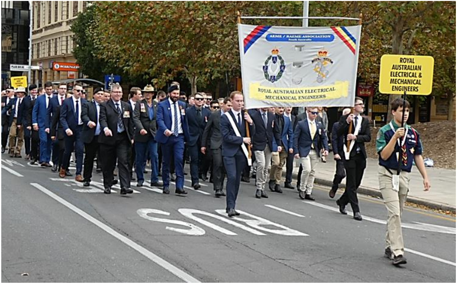
Our RAEME Association group just after stepping off