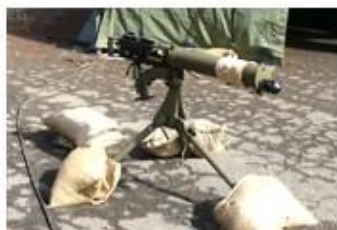
Weapons and Lots More