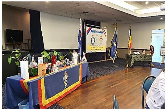
The Raffle prizes table