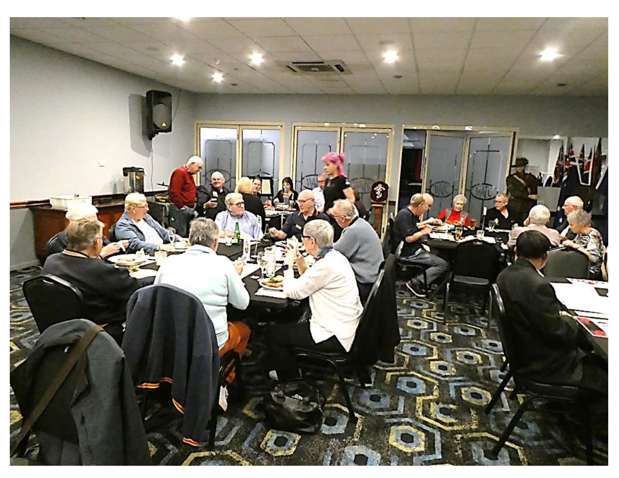
General view of "OUR" room at the West Adelaide FC