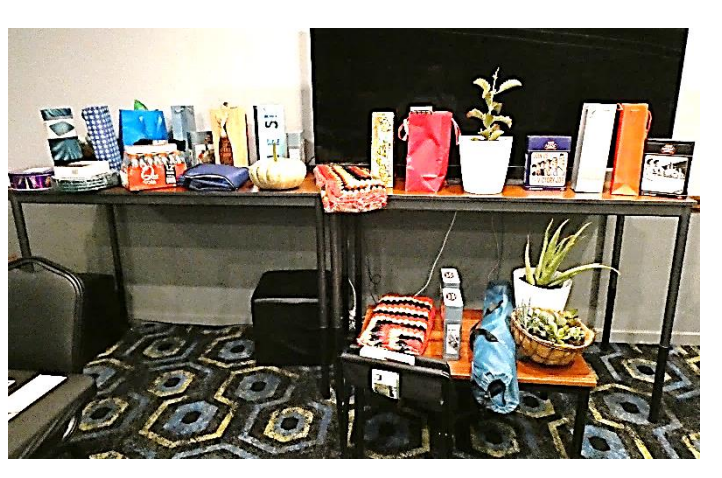
Raffle prizes table