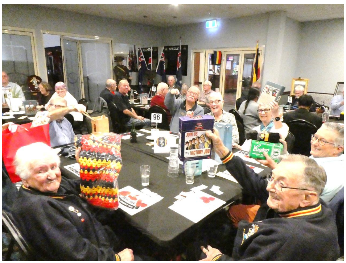
The REME Group Showing off all the prizes they won