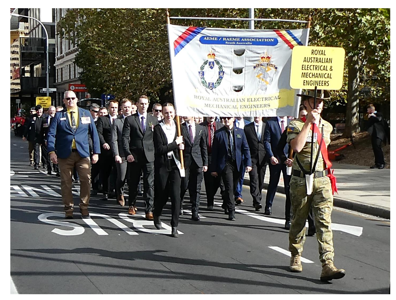
A fine body of RAEME soldiers