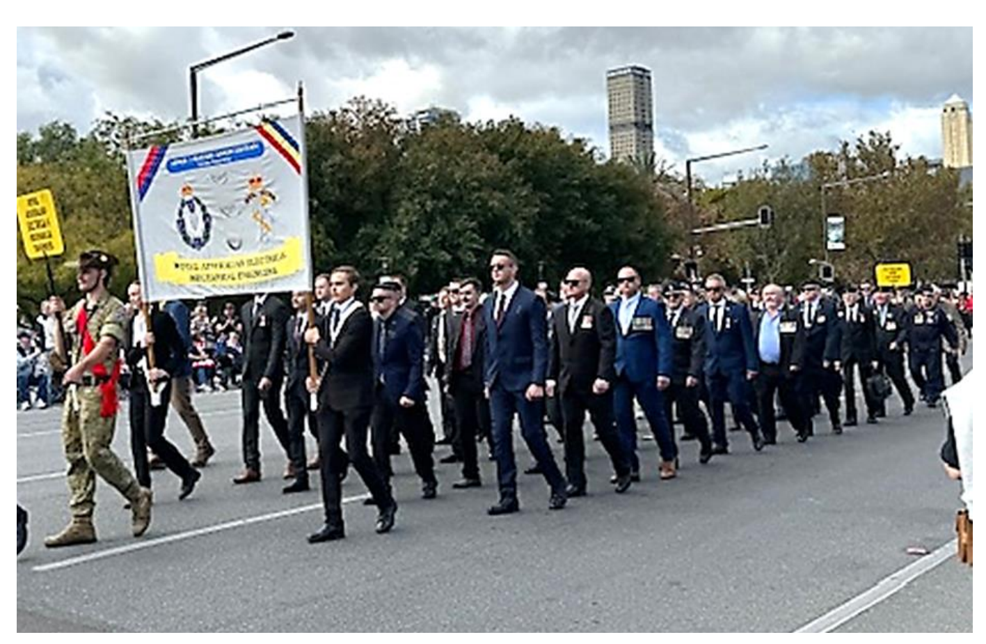
Marching down King William Road