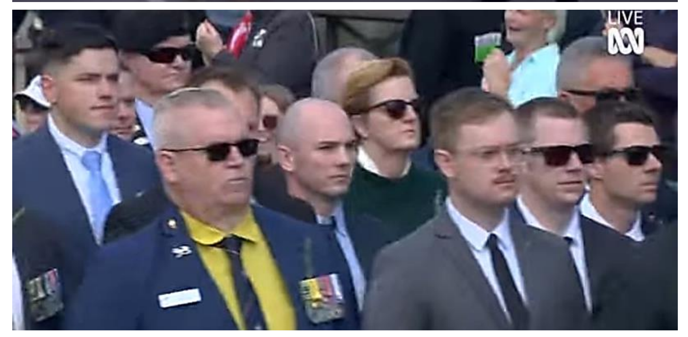
Clips from the TV coverage