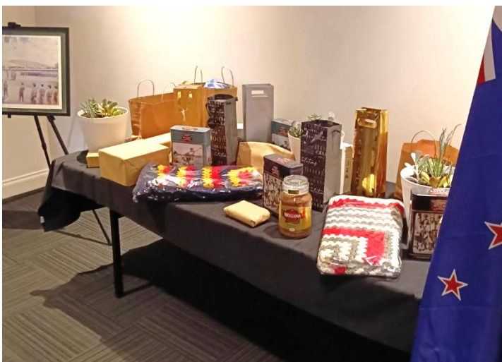
Raffle Prizes Table