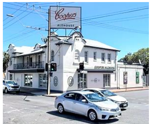
Coopers Ale House – Gepps Cross (Below) Flag Display