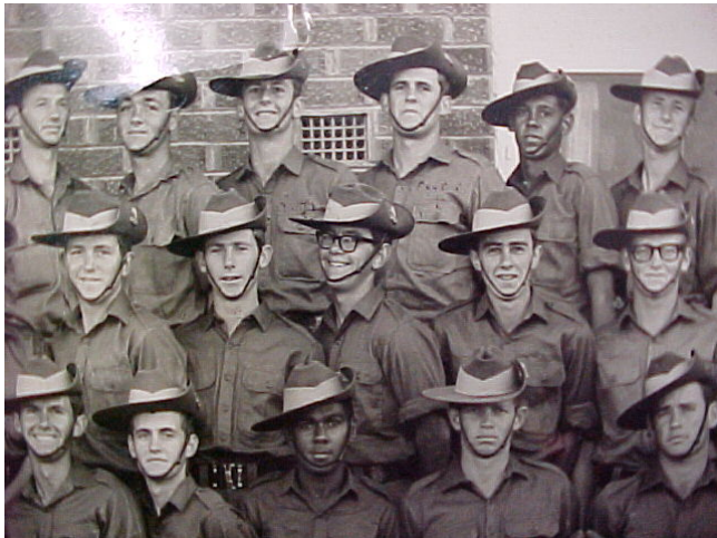
18 Platoon 'C' Company 1 RTB Kapooka May 1969